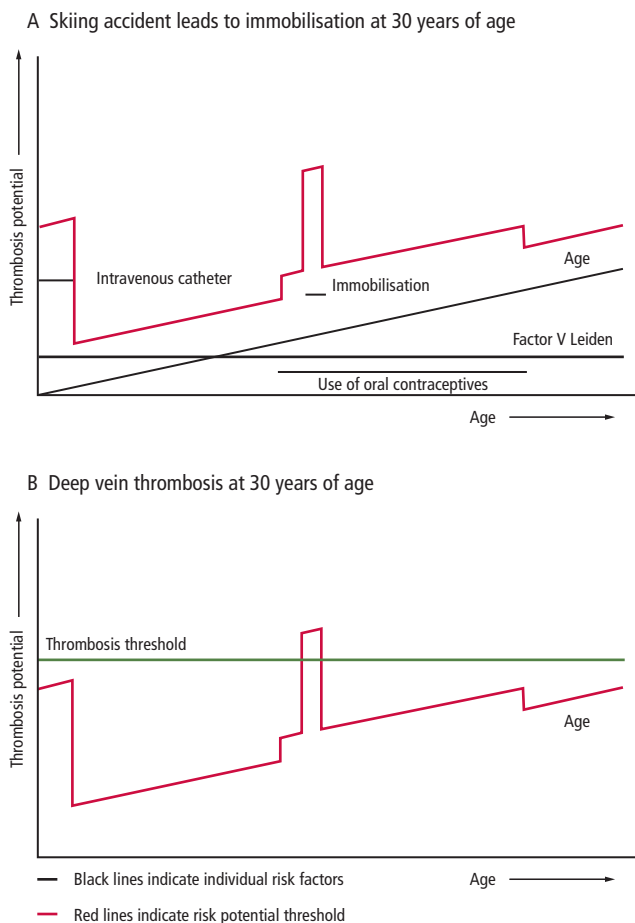
Figure 1: Model of Thrombosis Risk 6