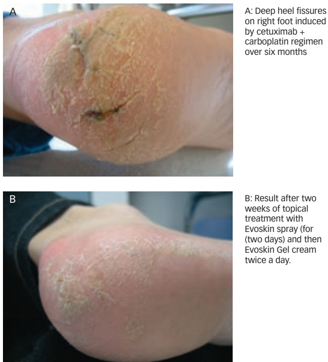
Figure 4: Deep Heel Fissures on Right Foot Before and After Treatment

cetuximab (Erbix) for six months. In order to reduce the fissures, Evoskin Solution Spray was sprayed on the heels morning and night for the first two days, then Evoskin Gel Cream was applied as a follow-up at the same dosage. Evoskin Solution Spray and Gel Cream are formulated from mineral elements contained in Evaux thermal spring water (lithium, manganese, strontium). Two weeks after starting application of Evoskin, the fissures were closing and their haemorrhagic nature had disappeared, and the discomfort under pressure had eased (see Figure 4B ). No intolerance to unguat Evoskin Solution Spray and Gel Cream was reported by the patient during the application period. Cetuximab (Erbix), an EGF receptor inhibitor, is a frequently used chemotherapeutic agent, especially in the treatment of ENT cancers expressing this receptor. The incapacitating fissured conditions induced by this molecule are often reported in the literature. The introduction of an effective product without side effects for topical use in a rapid timespan of several days for resolution of heel fissures observed during chemotherapy offers the patient a significant functional and aesthetic benefit by improving his or her quality of life and contributing to better adherence to the chemotherapy regimen.