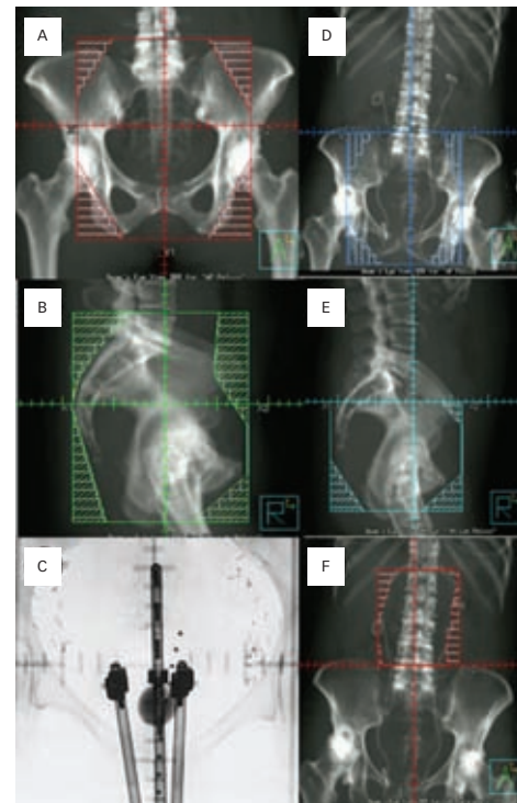
Figure 2: Example External Beam Radiation Fields and Low-dose-rate Brachytherapy

Anteroposterior (A) and right lateral (B) fields (two of four opposed fields) are shown with multi-leaf collimation shielding of organs at-risk for normal tissue toxicity. Anterior fluoroscopic projection of a low-dose-rate tandem-ovoid applicator is depicted for an intracavitary brachytherapy of an advanced stage cervical cancer (C). Dummy sources are positioned in the tandem-ovoid device. A graduated marker is positioned in the rectum. A Foley catheter balloon is shown filled with radiopaque fluid (7 ml). Anteroposterior (D) and right lateral (E) half-beam projections are provided as part of an extended four-field arrangement for the treatment of cervical cancer with disease-proven para-aortic lymph node involvement. A matched, half-beam anteroposterior extended treatment field is shown (F). An opposed posteroanterior would also be used.